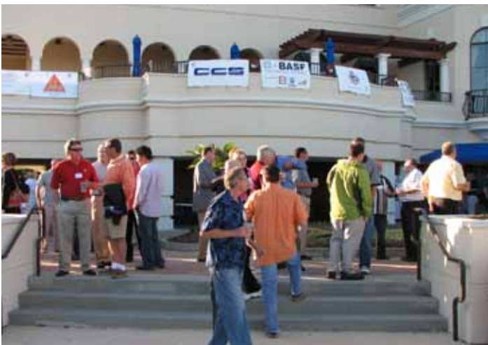
Part of the crowd enjoying the festivities under the sponsor banners at the Ocean Club.