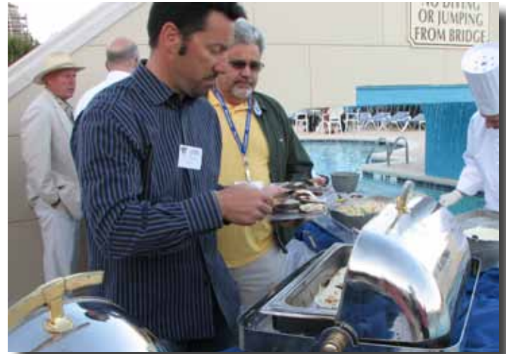
Good food was not in short supply as party goers went back for seconds and thirds on the Low Country Boil.